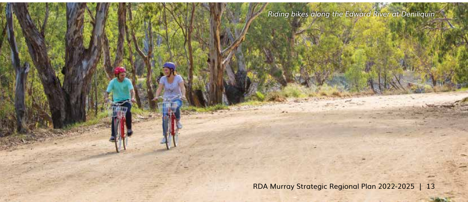
Riding bikes along the Edward River at Deniliquin