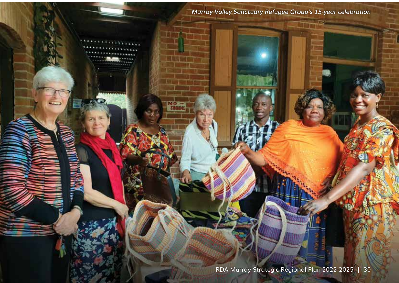
Murray Valley Sanctuary Refugee Group's 15-year celebration

Yarkuwa Indigenous Knowledge Centre Aboriginal Corporation