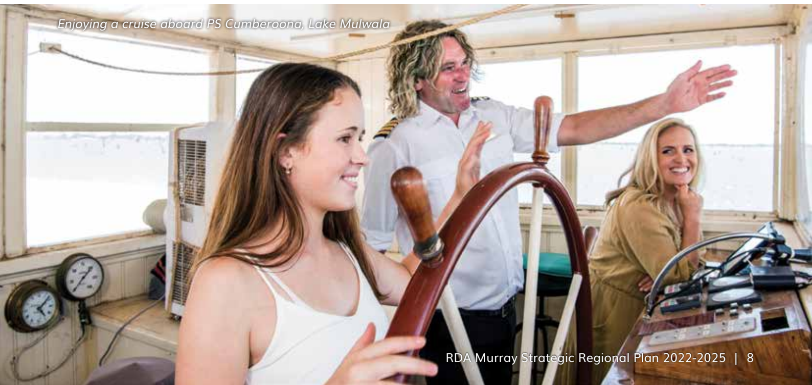
Enjoying a cruise aboard PS Cumberoona, Lake Mulwala

We also formalised our role in ground-truthing the Federal Think Tank.