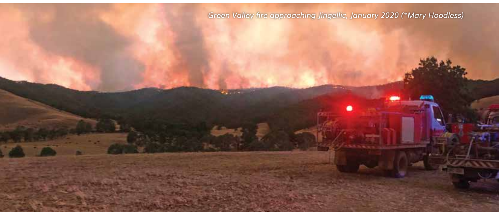
Green Valley fire approaching Jingellic, January 2020

Our economy was buoyed by a third consecutive, widespread, outstanding agricultural season with significant flow-on into manufacturing. This created a sound base from which to participate in local procurement and supply for Project Energy Connect, Hume Link, VNI West, Riverina Redevelopment, Inland Rail and Snowy 2.0