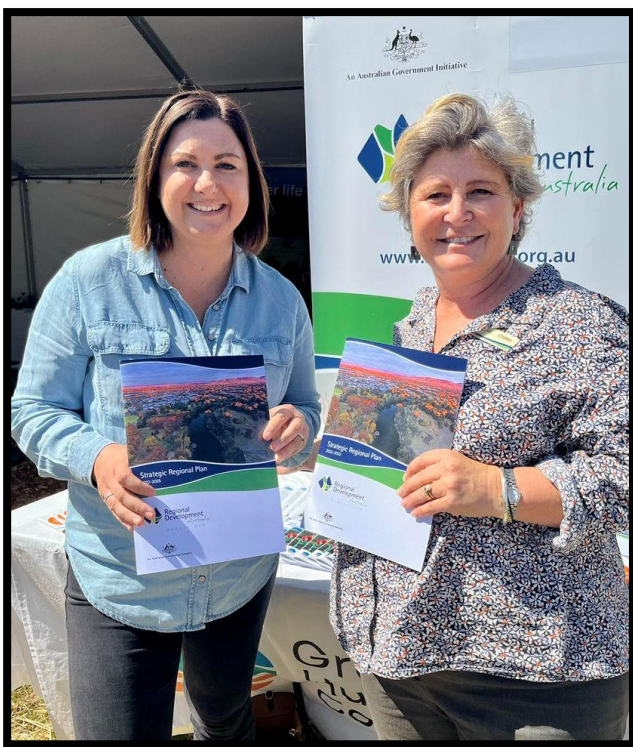
2 MINISTER KRISTY MCBAIN LAUNCHING THE RDA MURRAY STRATEGIC REGIONAL PLAN WITH CEO EDWINA HAYES AT HENTY MACHINERY FIELD DAYS. SEPT 2022